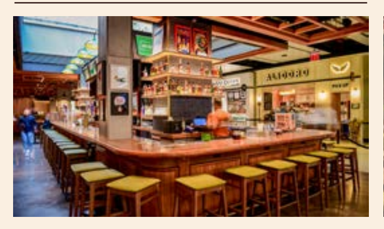
GRAND CANAL BAR