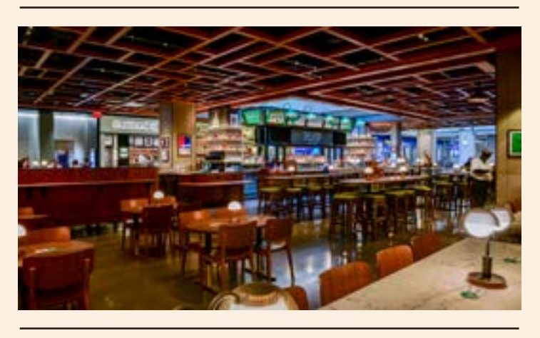
PEARSE & HEUSTON